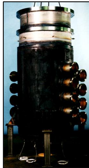
Isothermal Processing Vessel That Uses High Temperature Heat Pipes