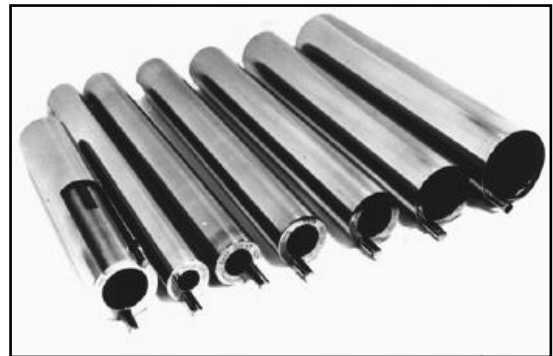
Figure 1 – High Temperature Heat Pipes