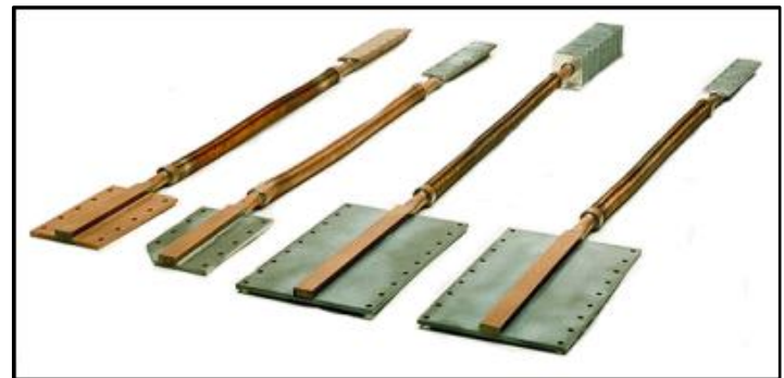
Figure 2 – Flexible Heat Pipe Cold Plate