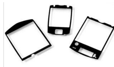
Figure 4: Display gaskets seal against contaminant ingress and manage drop shock or vibration resistance.

Boyd addresses the requirements of advanced display technologies. They provide their customers with multifunctional components including integrated display gaskets and bezel bonding solutions, where local secondary applications are optimized by including in the original design. Boyd can pull