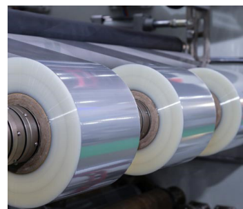
Figure 5: Highly transparent optically clear adhesives (OCA) for bonding visually clear components.

Boyd’s display technologies utilize sheet-type optically clear adhesives (OCA) when bonding visually clear components, such as touch screens, graphic overlays and polymeric film glass laminates. Sheet-type OCA addresses inherent limitation that can affect screen brightness, contrast ratio and the durability of these die-cut integrated display gasket solutions.