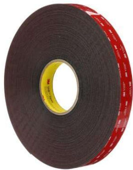
Figure 3: 3M VHB™ acrylic foam tape, 5952, black, 1 in x 36 yd, 45.0 mil.

The 3M™ VHB™ Tape 59xx Series encompasses a wide range of high performance bonding tapes that fulfill most bezel bonding and display gasket applications. These tapes are available in a thickness range from 150 µm to 1.6 mm. They are supplied with a modified acrylic adhesive on both sides of a very conformable adhesive foam core, providing good adhesion to the widest range of substrates, including most powder coated paints and many plastics. These are the go-to tapes for most electronic display bonding applications.